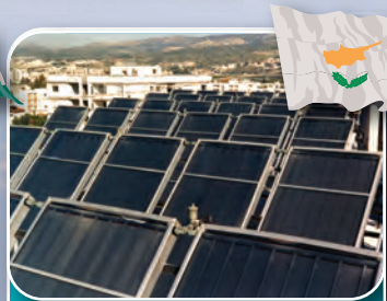
Cypria Maris Hotel