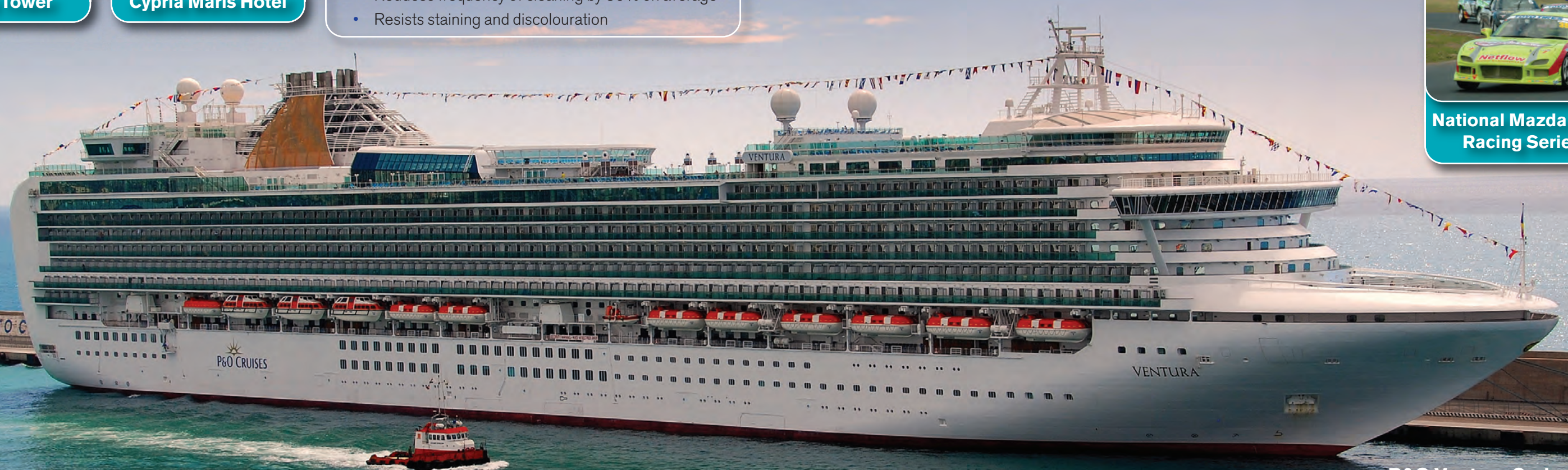
P&O Ventura Cruise Liner