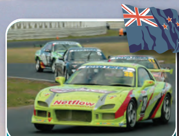
National Mazda Pro7 Racing Series